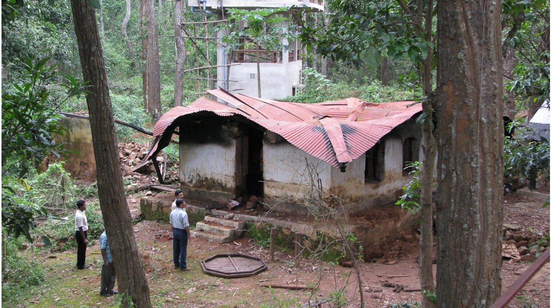
Destroyed staff facility in Joranda