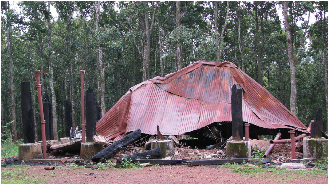
Log house at Jenabil Range before (top) and after (bottom) the extremist attacks.