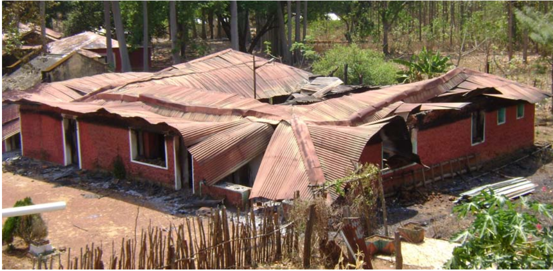
Range office at Chahala which was blown up and burnt down during the extremist attacks.