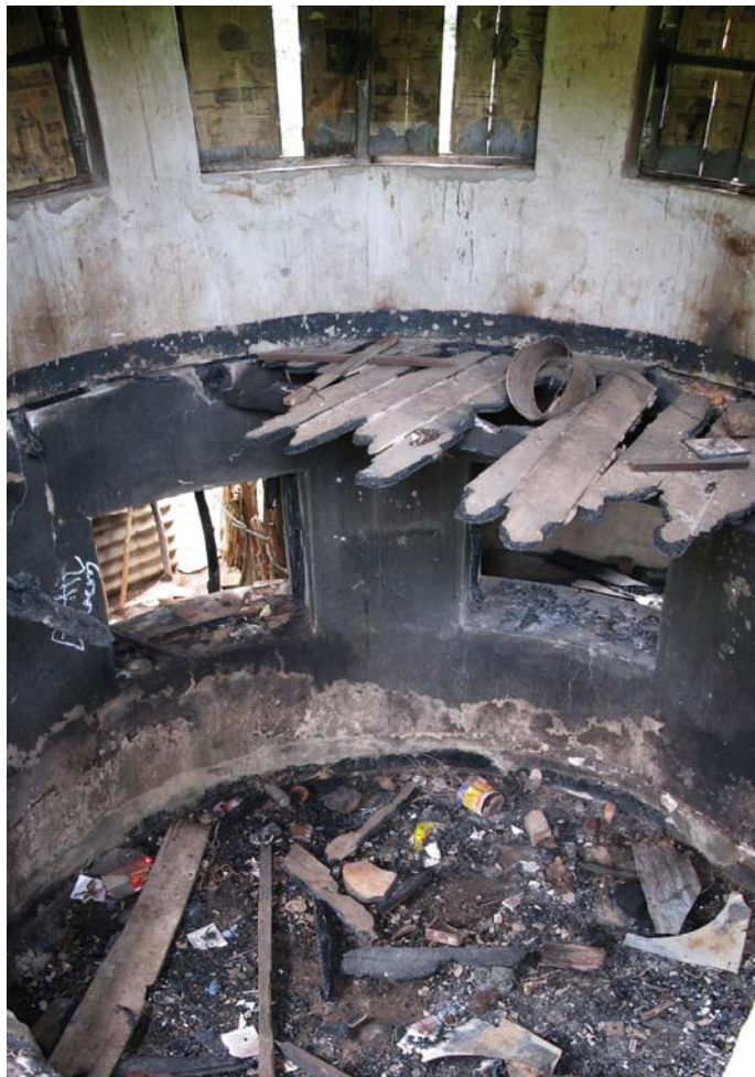
Beat Station at Debasthali after it was burnt