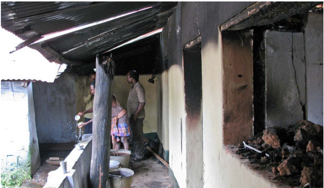
Forest staff camping in the charred remains of the blown-up Upper Barhakamuda range office.

In particular, we would like to pay a special tribute to the commitment and courage of the frontline field staff of Similipal. Without even the most basic infrastructure or logistical support, many of them continue to endure tremendous physical hardship and intense fear, as they resume positions in the remote corners of Similipal to protect the reserve, its wildlife and their habitat.