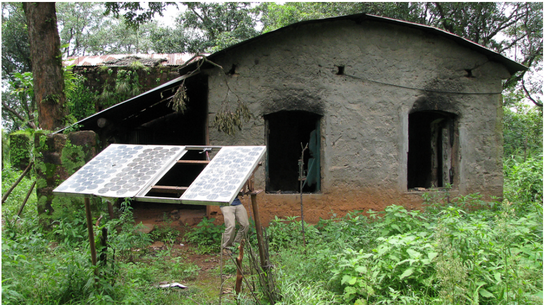
Damaged building and equipment at the wireless repeater station at Meghasani