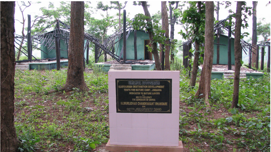
Tourism facility at Joranda at the time of inauguration (top) and after extremist attacks (below)